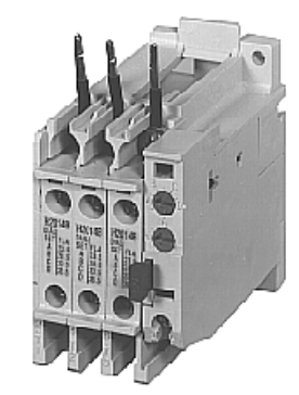
Series B1 32A Overload