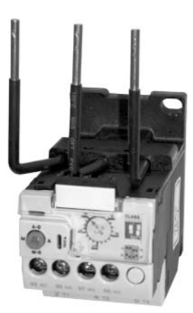
C396 Electronic Overload

tect motor branch circuits from fault conditions. If higher ratings or settings are required to start the motor, do not exceed the maximum as listed in Exception No. 2, Article 430-52.